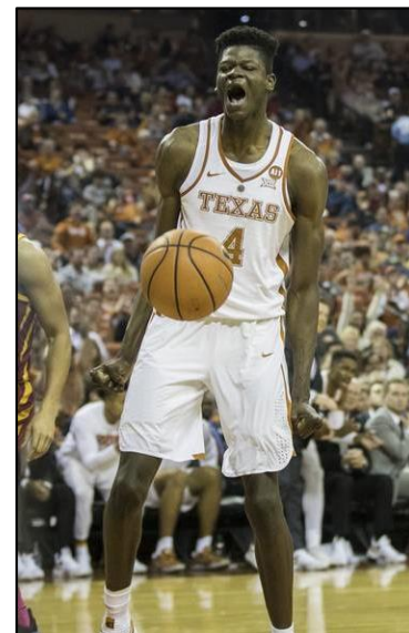
Mohamed Bamba was selected with the 6th overall pick in the 2018 NBA Draft by the Orlando Magic