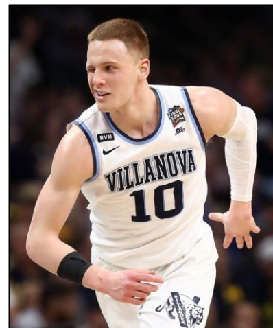
Donte DiVincenzo was named 2018 Final Four Most Outstanding Player and was selected with the 17 th overall pick in the 2018 NBA Draft by the Milwaukee Bucks