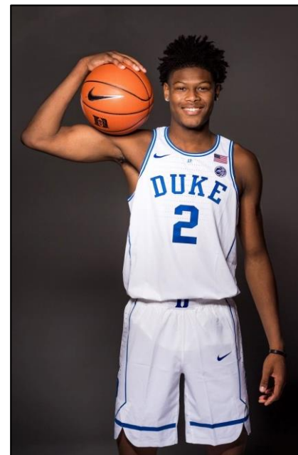
Cameron Reddish is a Freshman at Duke University and is projected as a Top 5 selection in the 2019 NBA Draft.